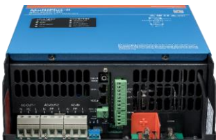
Connection Area MultiPlus-II 4k5